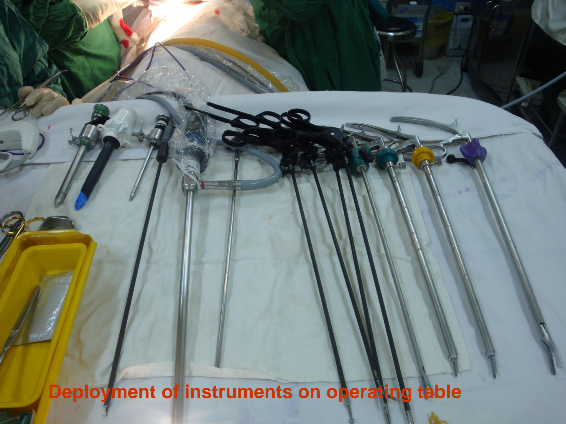
Deployment of instruments on operating table