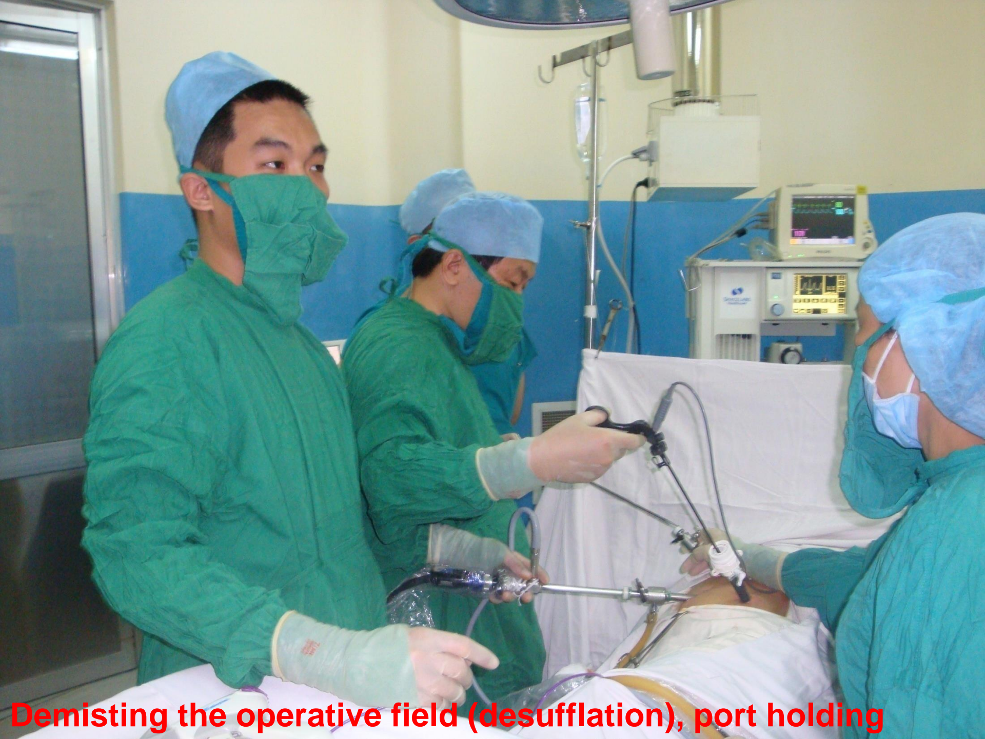
Demisting the operative field (desufflation), port holding