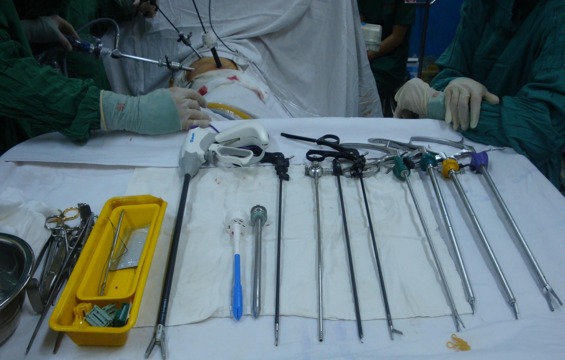
Deployment of instruments on operating table