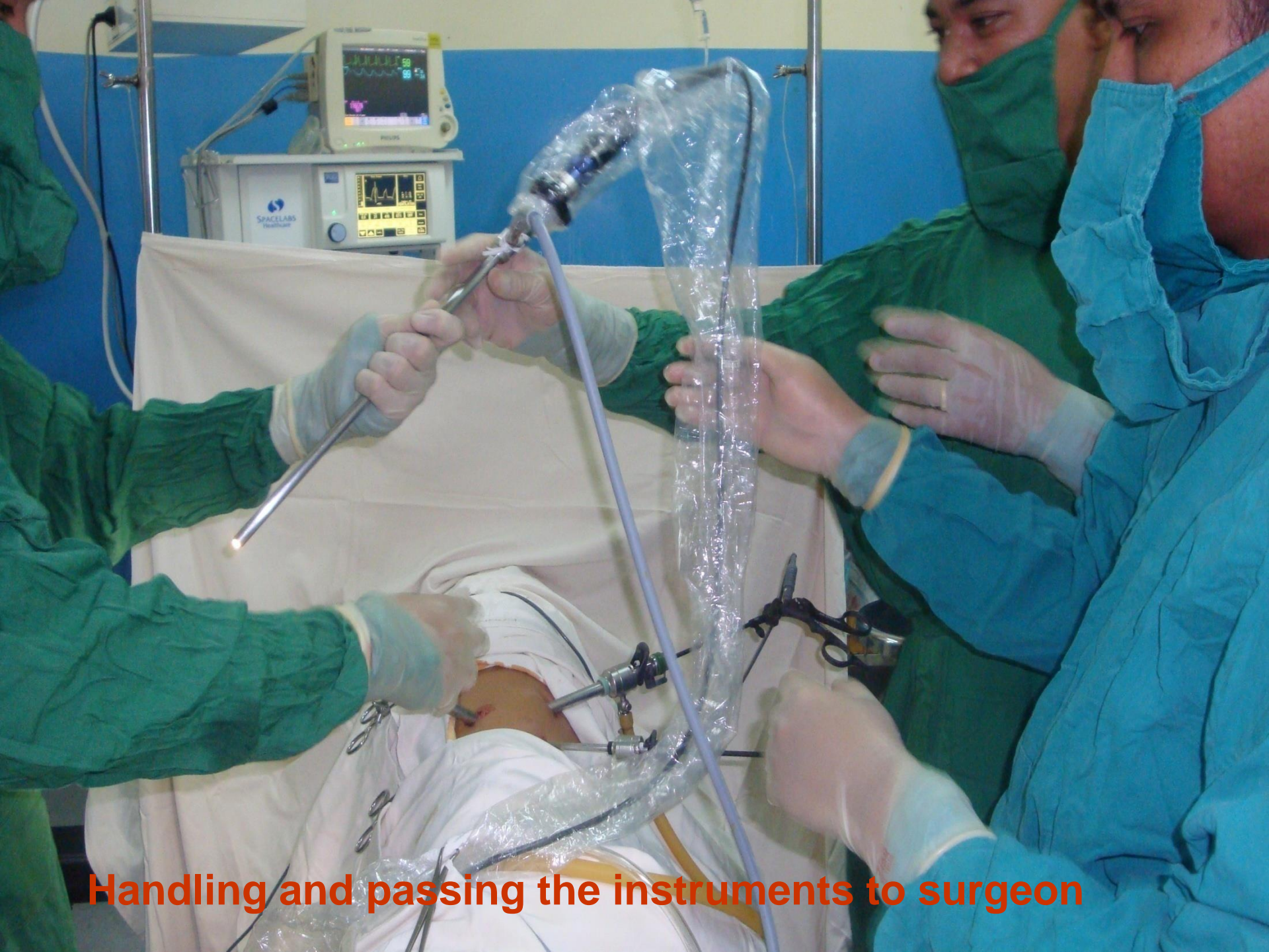
Handling and passing the instruments to surgeon