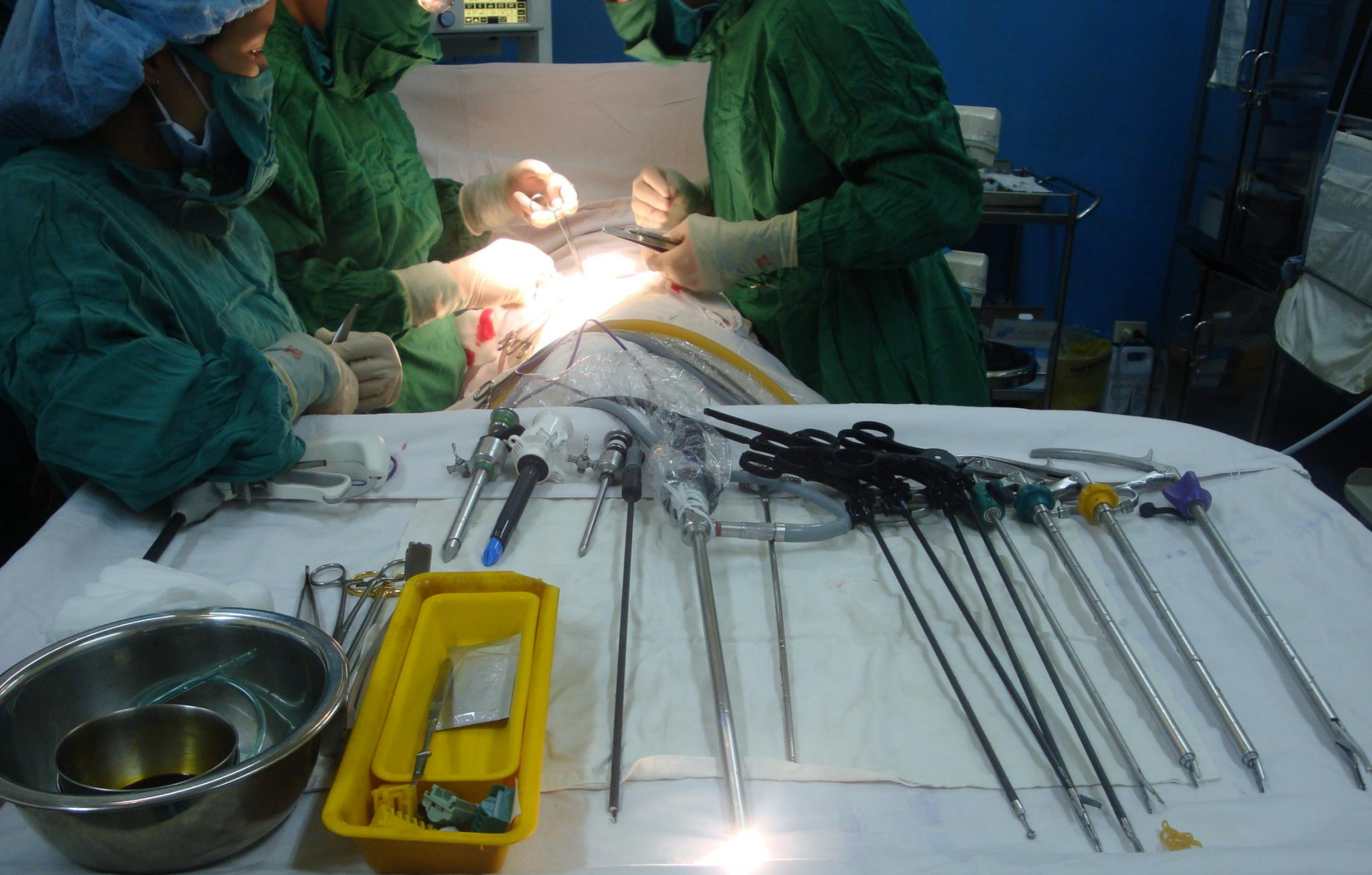
Deployment of instruments on operating table