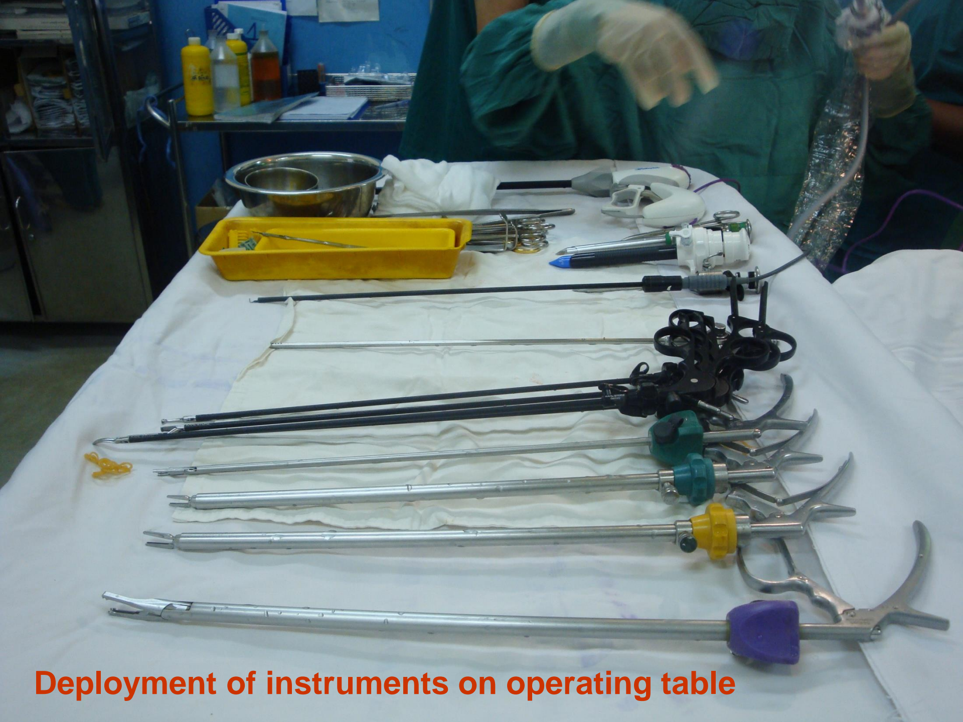
Deployment of instruments on operating table